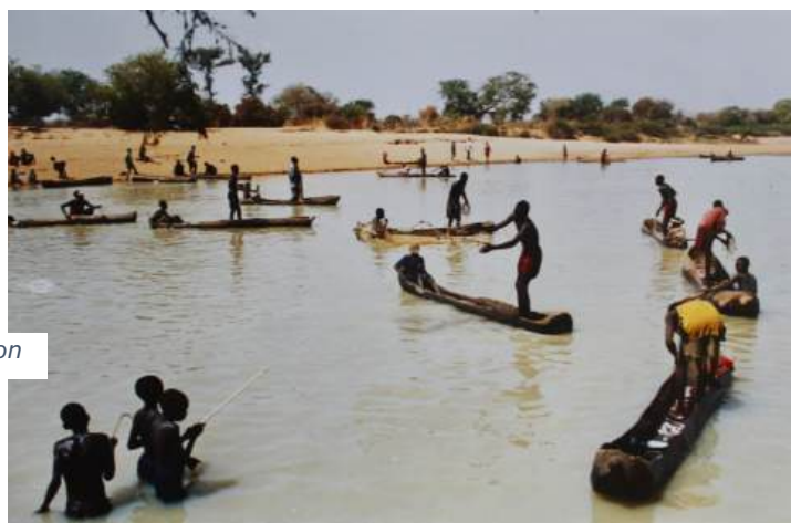
Netting fish as the waters recede in the dry season

http://documents.wfp.org/stellent/groups/public/documents/reports/wfp065383.pdf