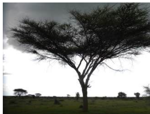
Kotido District, Karamoja

Team leader of a final evaluation of a development program in Karamoja funded by DFID and implemented by the UN Food and Agriculture Organisation (FAO) known as ‘Strengthening Resilience and Adaptive Capacity of Agro-Pastoral communities and the Local Government to Reduce Impacts of Climate Risk on Livelihoods in Karamoja’.