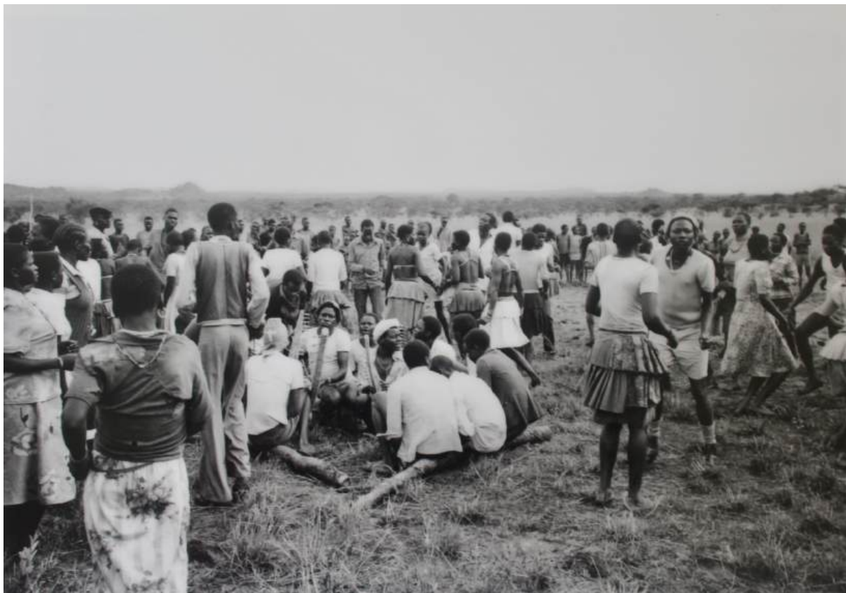
Dance led by our own band to celebrate construction of our first school in Lolelia (single classroom, grass thatched)

Established and managed the Lolelia Development Project in Karamoja to resettle conflict and drought affected Karamajong on productive land and seek livelihood security. After three years the number resettled around Lolelia had grown to 7,300 in 13 new villages. We had established cropping, a food coop, installed wells, built basic schools and health centres. None of it was straight-forward and we faced many problems with insecurity in the region.