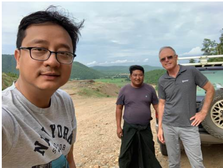
On the road to Sagaing

Team leader of a review of the Department for Rural Development's Mya Sein Yaung or Evergreen Village Development Programme (micro-finance) operating in over 11,000 villages across Myanmar. Qualitative focus. Field work included visits to sixteen randomly selected village units across four randomly selected Townships: Zigon (Bago Region); Katha (Sagaing Region); Tangyan (Shan North State); and Loikaw (Kayah State).