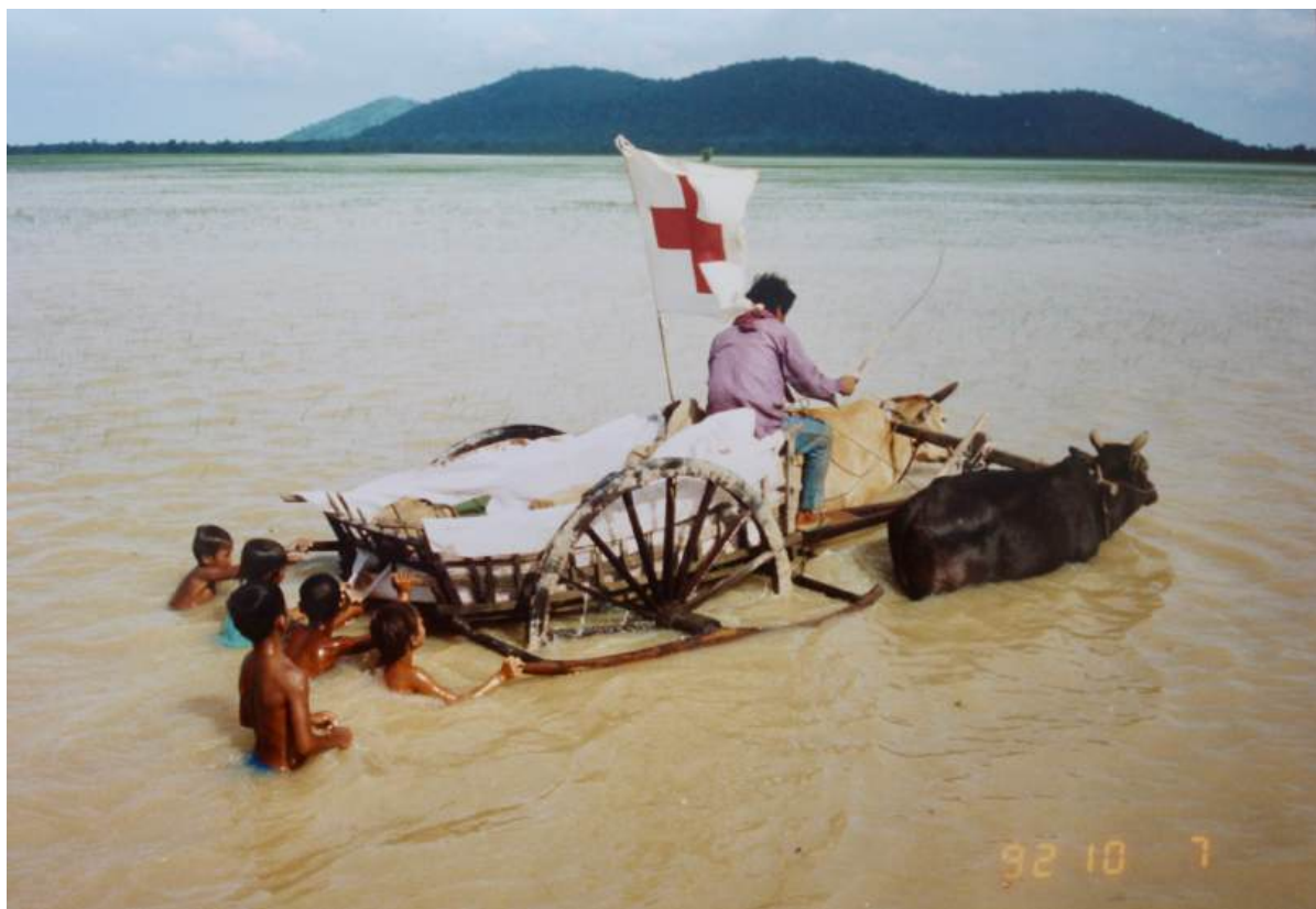
The only way I could get around in the wet season to conduct human rights monitoring