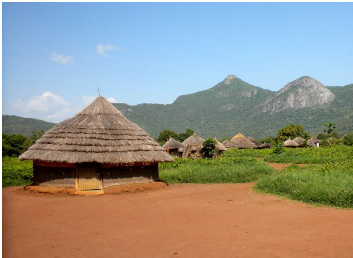
Agago District, northern Uganda

Evaluated the Farmer Field School Components of two EU funded post-conflict rural recovery and development projects (ALREP and KALIP) implemented by UN FAO in northern Uganda and Karamoja. http://www.opm.nulep.org/documents/alrep-partner-documents/item/download/1317_93ae3080232a69f68b10c3dafb2fa76b