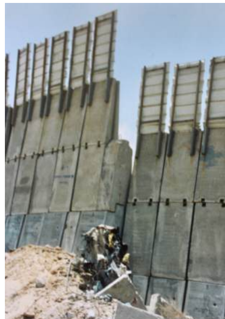
A section of Israel's dividing wall

Led the Mid-term Review of Asian Disaster Preparedness Center (ADPC) 'Mainstreaming Disaster Risk Management and Institutional Development Projects' funded by Australia. Reviewed Phase 1 and advised if should proceed to Phase 2. Consultations with ADPC, Post and others in Bangkok.