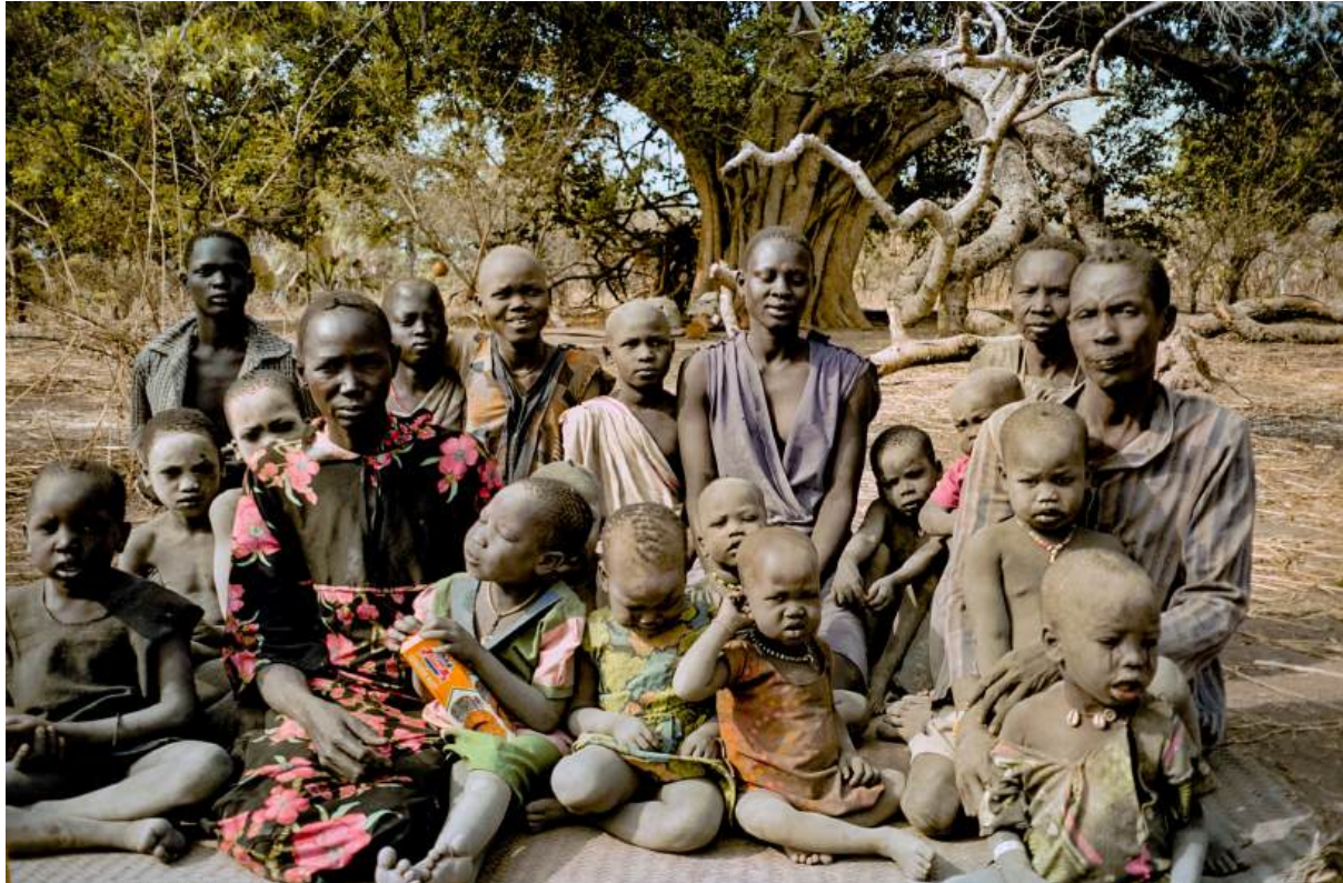
Interviewing mothers about their access to health care, Rumbek County

Contracted by Oxfam Australia to conduct an Independent Completion Evaluation of the three-year AusAID funded Rumbek County Primary Health Care Project implemented by Oxfam GB.