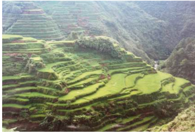
Rice terraces, Ifugao

Contracted by OXFAM Australia to lead an evaluation of the AusAID funded 'Ifugao Northern Upland Communities Sustainable Development Project', an integrated area development project implemented by Community Aid Abroad and the Philippines Rural Reconstruction Movement. Three weeks field work and use of participatory rural appraisal (PRA) techniques.