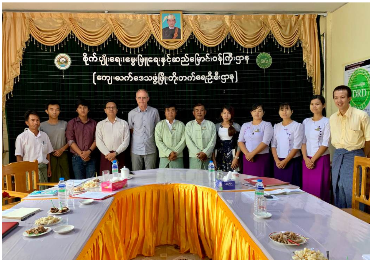
One of several formal meetings with regional offices of the Myanmar Department of Rural Development (DRD)

Supported in the field by the Enlightened Myanmar Research Foundation. Contracted through Cardno UK for the Centre for Good Governance funded by the UK Government.