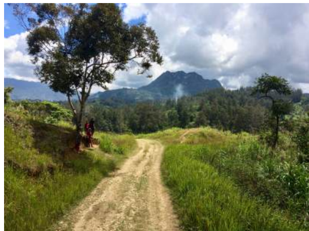
Visiting communities in highland PNG

http://dfat.gov.au/about-us/publications/Pages/evaluation-of-australias-response-to-png-el-nino-drought-2015-2017.aspx