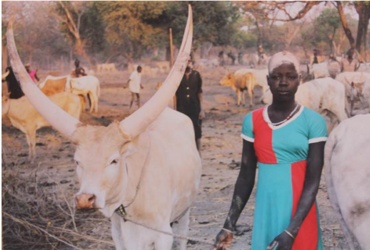
"Please photograph my uncle's bull" - Ameth cattle camp, Rumbek County