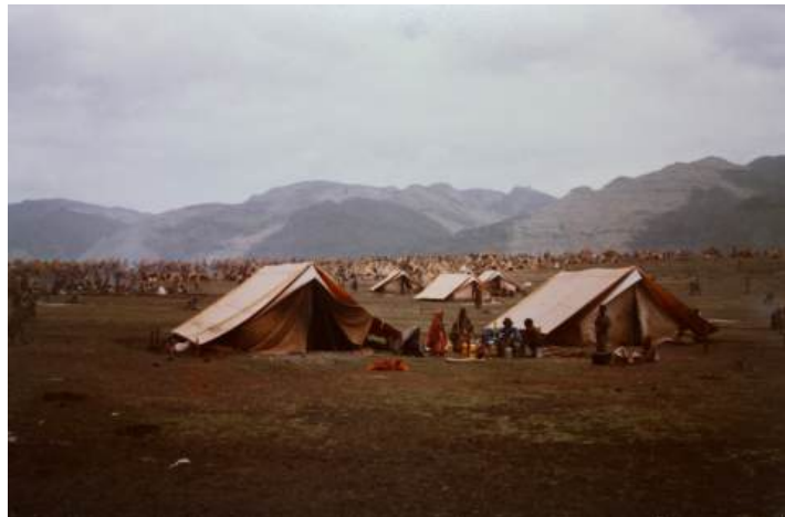
Thousands of people displaced by war and drought from Tigray

Responsible for SCF's central stores and helped deliver emergency medical and other supplies to hospitals and clinics in the Luwero Triangle north of Kampala which was the epicenter of the 'bush war' being fought between government forces and the rebel National Resistance Movement that finally seized power in January 1986.