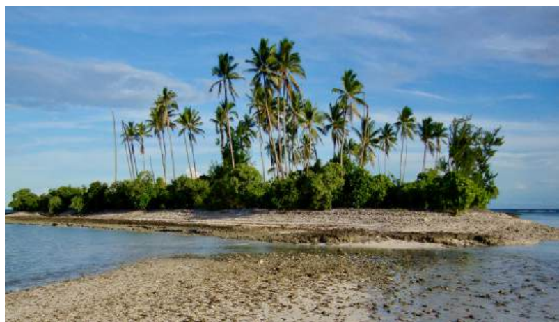
Under threat from climate change - Tarawa, Kiribati

Led multi-disciplinary team to three countries in the Pacific to conduct a combined review of two related projects – the ‘Pacific Islands Climate Prediction Project Phase 2’ and the ‘South Pacific Sea Level and Climate Monitoring Project Phase 4’.