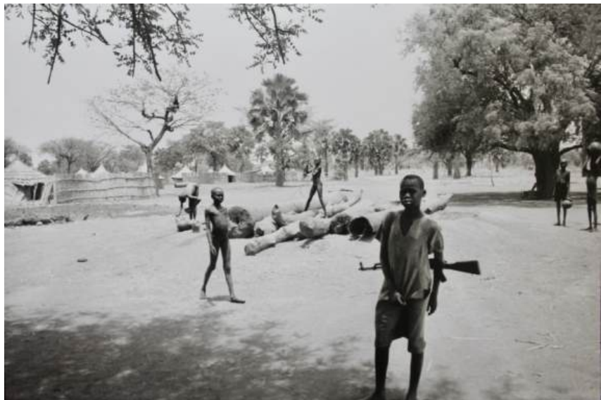
Drawing water from an old hand dug well - Lakes District, Eastern Bahr el Ghazal

Tasked by Oxfam UK & Ireland to establish and manage a rehabilitation and development program in Bahr el Ghazal and Western Equatoria addressing primary health care, water supply and sanitation, veterinary services, and food security/livelihoods.